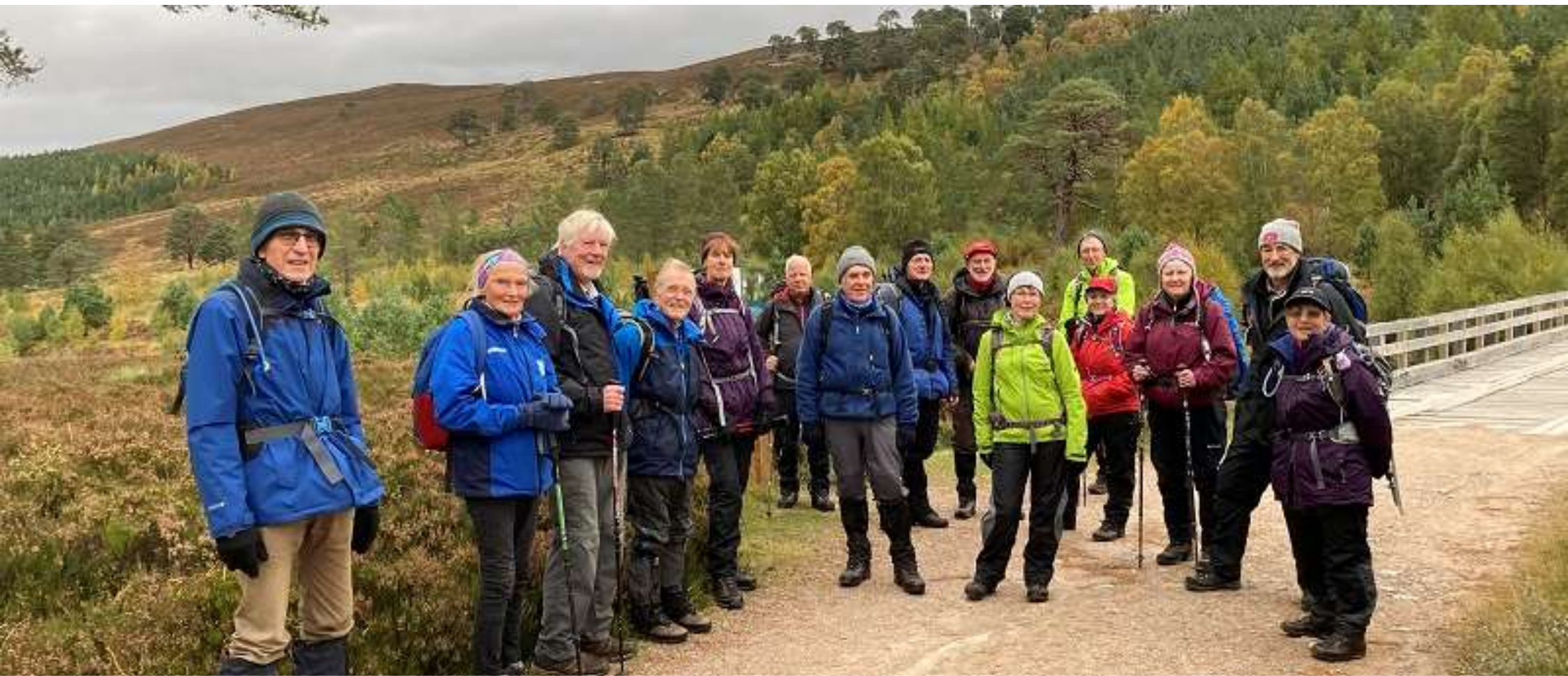
2 nd attempt at An Socach – Linn of Dee to Quoich 9 October