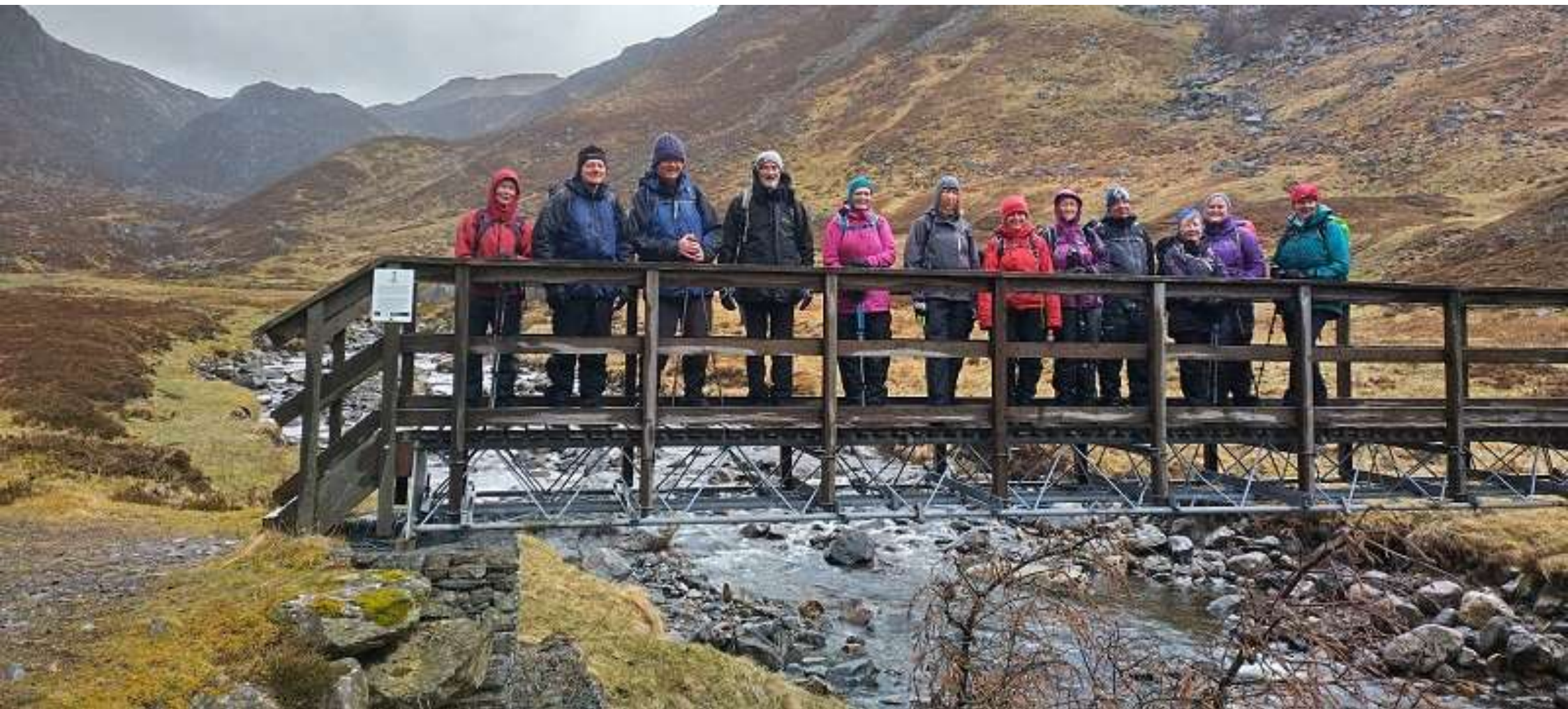
Glen Doll 2 April 2023