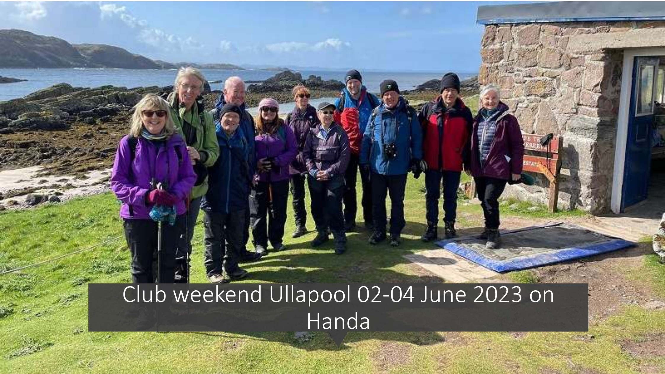
Club weekend Ullapool 02-04 June 2023 on Handa