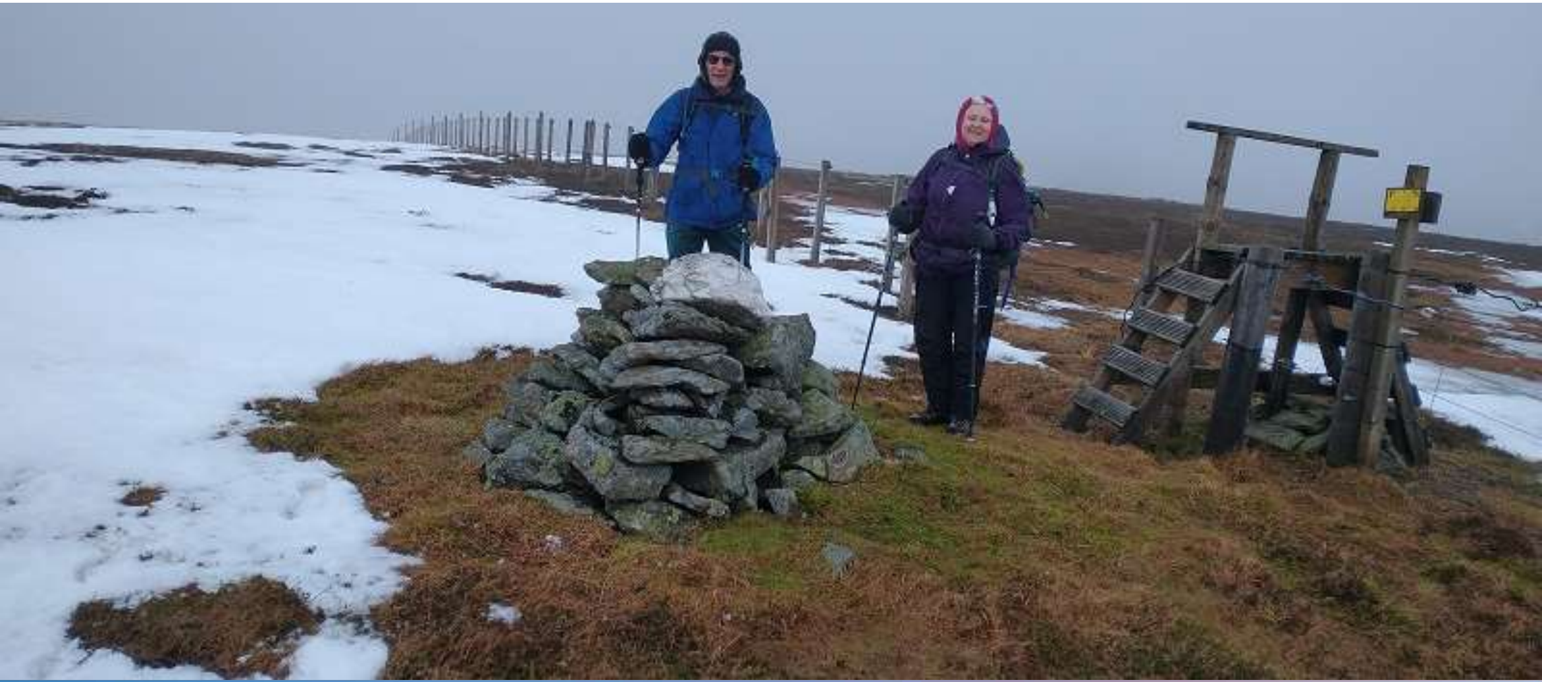
South Glen Clova from Gella Bridge A team on White Hill 8 January 2023