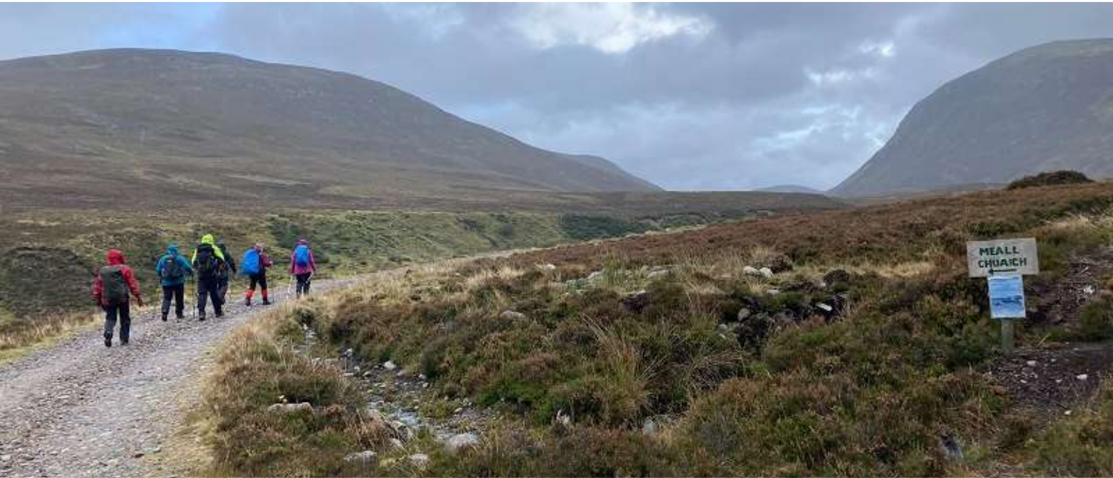
Meal Chuaich /Drumochter 30 October