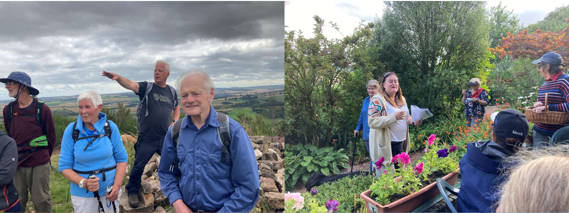
BBQ at Balmullo 19 August 2023