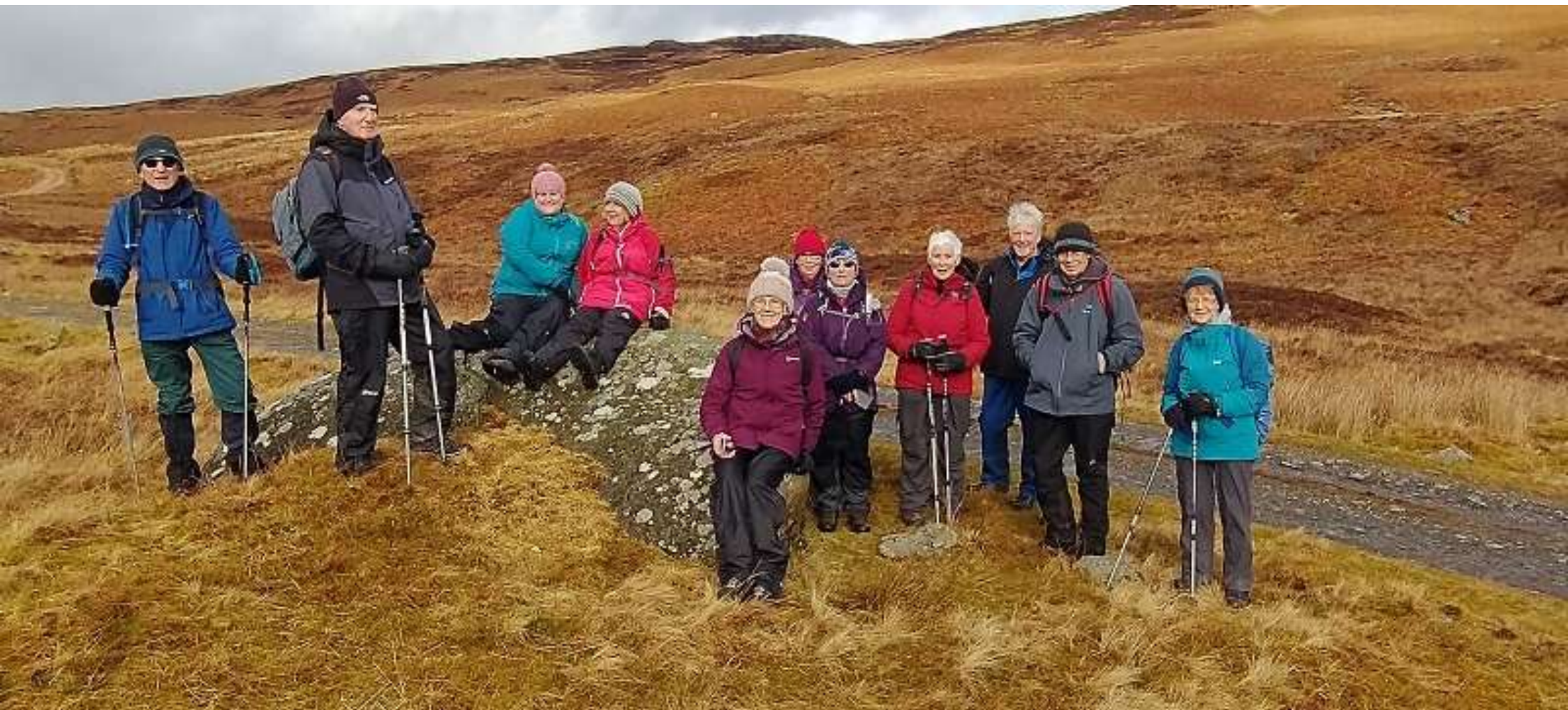
St Fillans 19 February C group well wrapped up