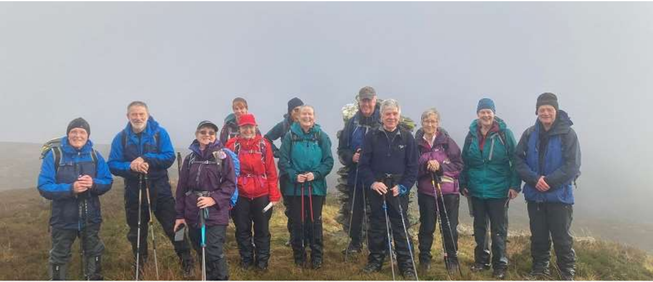
Backwater dam/Glen Isla 20 November on Corwham