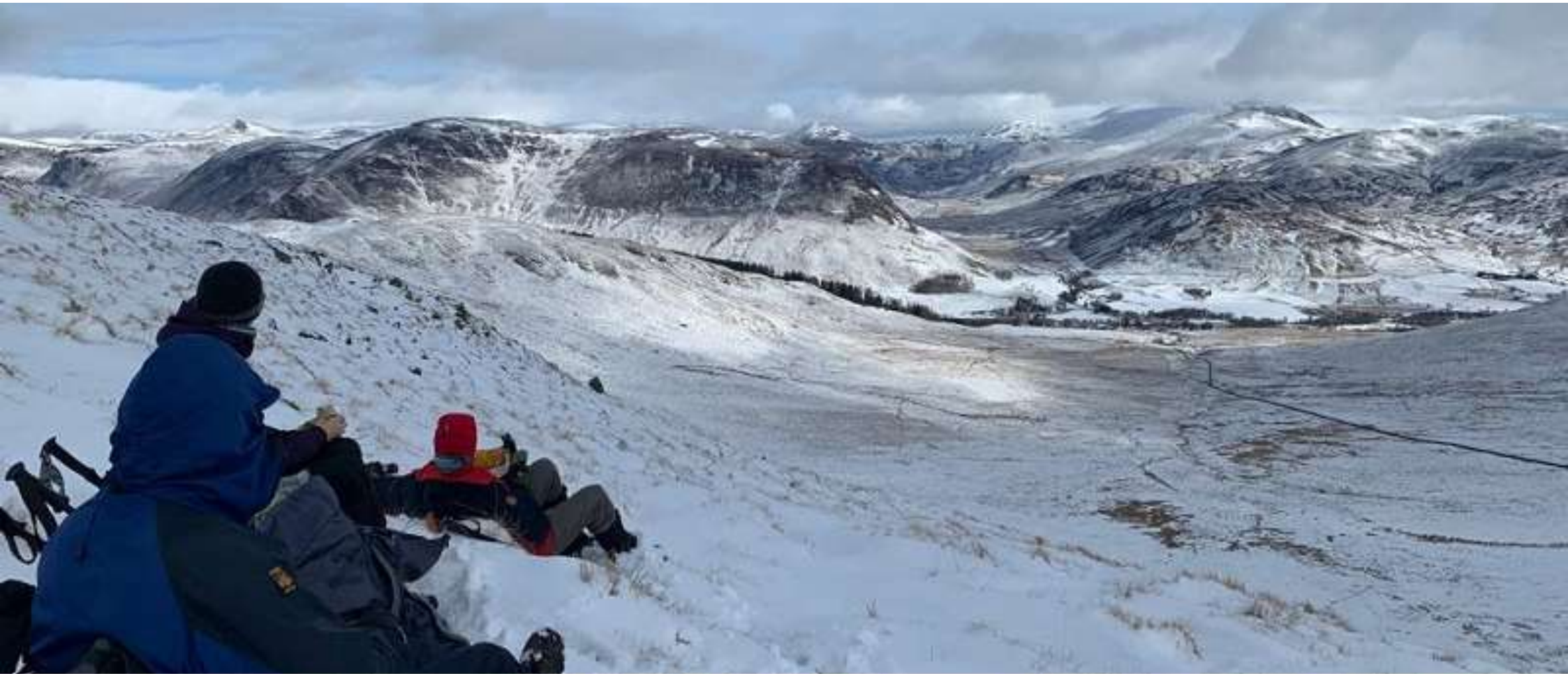
Not Rannoch Station, but sparkling Glen Shee 12 March 2023 heading to Meall Uaine