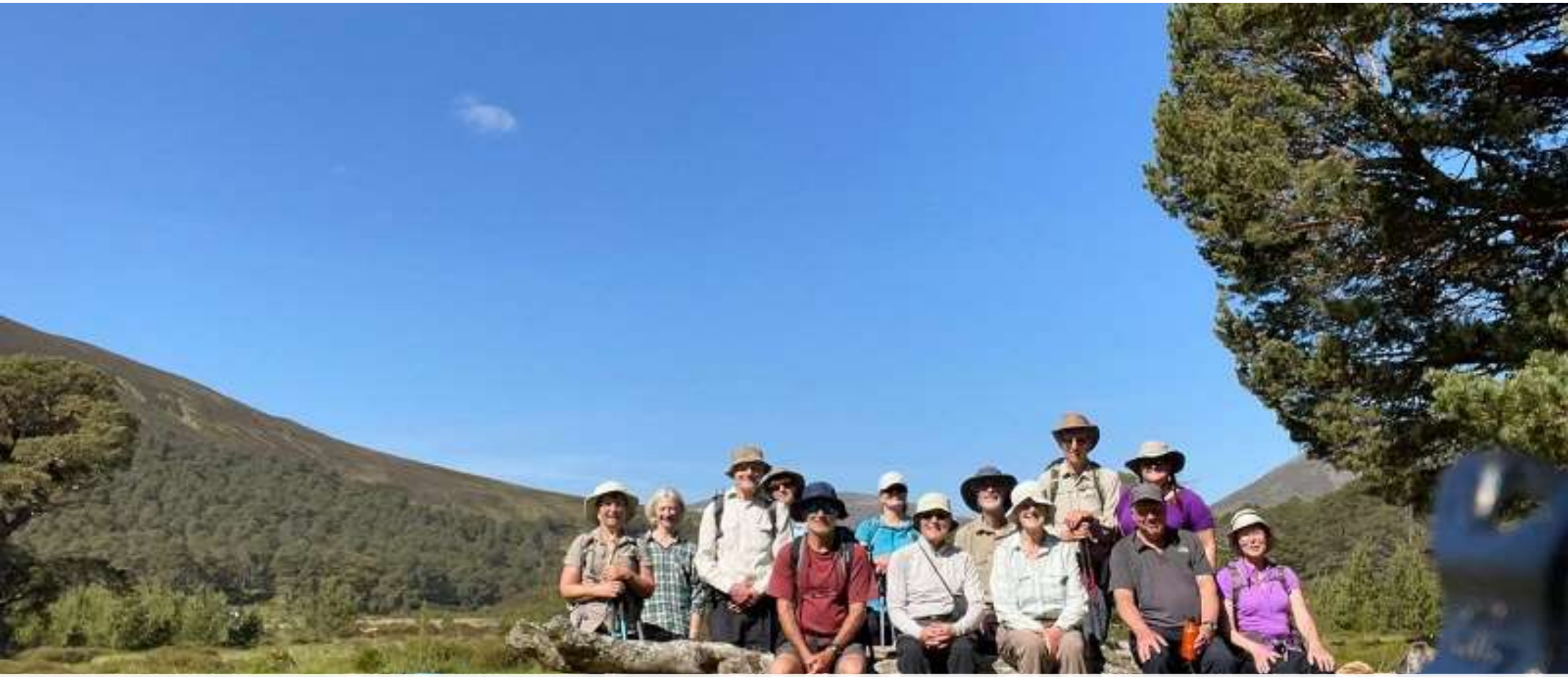
Beinn Bhreac Glen Derry 4 June 2023