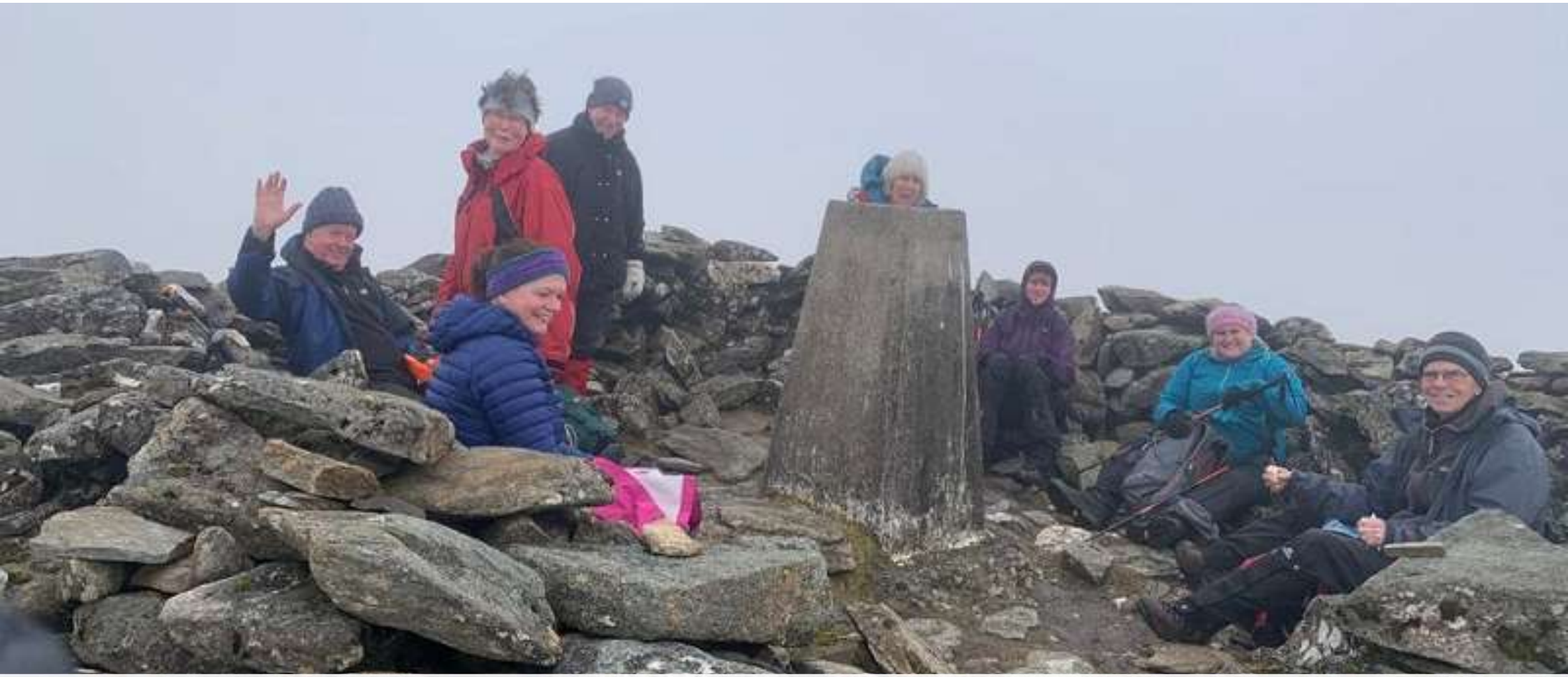
Glen Lochay 2 April 2023 on Meall Ghaordaidh