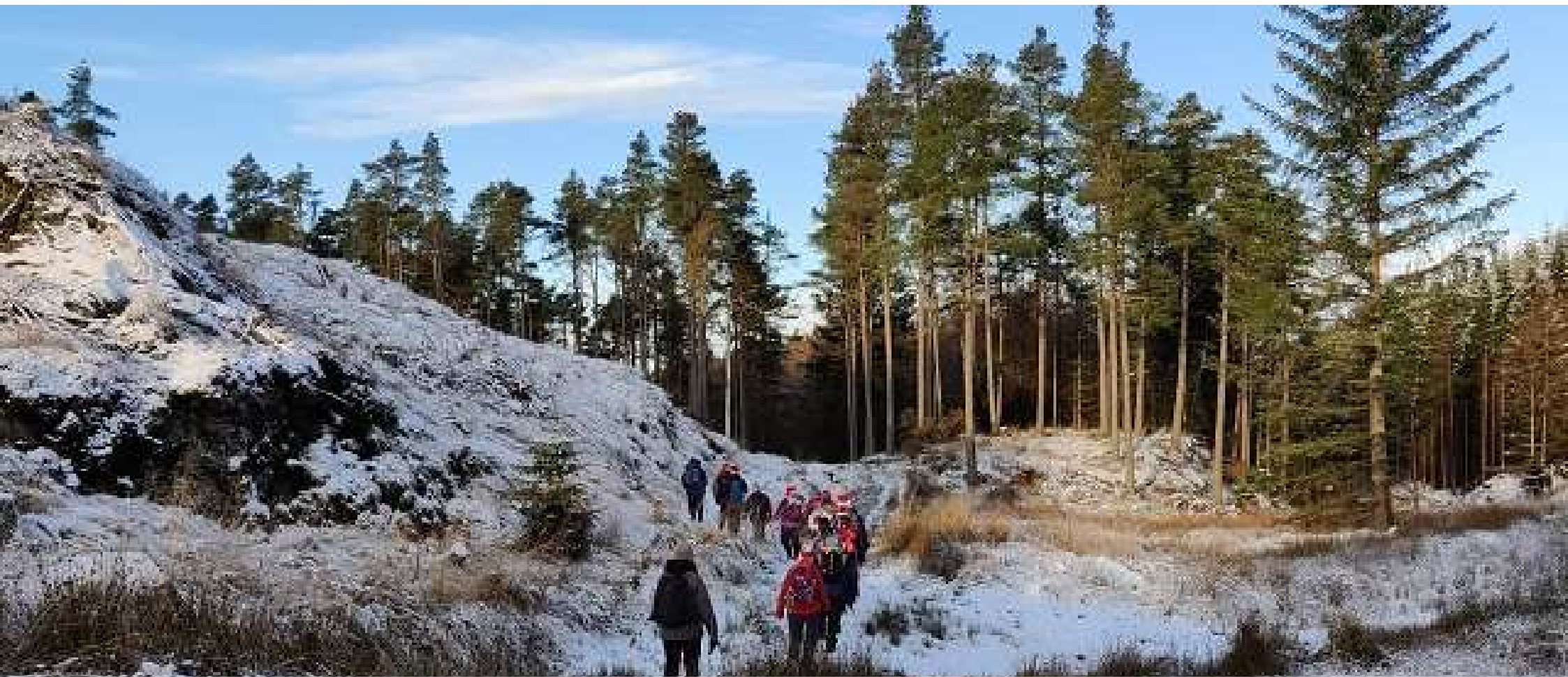
Christmas walk Dunkeld 11 December Lady's Charlotte's cave, rocking stone and King's Seat